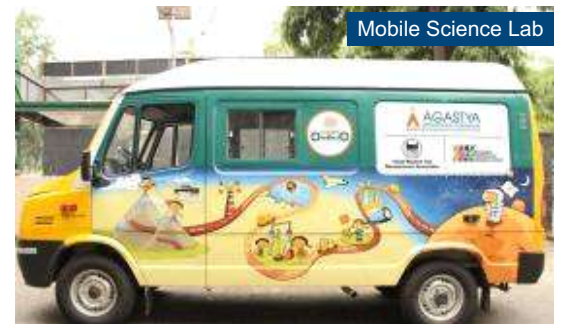
Mobile Science Lab

During FY 2025-26, IMTMA implemented a diverse range of CSR initiatives with a strong focus on education and holistic development. IMTMA continued its partnership with Agastya International Foundation for the Mobile Science Lab programme, which has been supported by the Association since 2018. The initiative brought hands-on science learning to rural schools through activity-based experiments, science fairs, seasonal camps, and community outreach programmes. The programme encouraged scientific thinking, curiosity, creativity, and experiential learning among students while engaging teachers and local communities. Activities conducted during the year included thematic events such as National Science Day, National Mathematics Day, National Youth Day, National Sports Day, and World Environment Day. Through regular engagement with schools and communities, the programme continued to strengthen scientific temperament, student participation, and application-based learning.