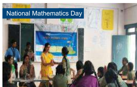
National Mathematics Day

IMTMA also strengthened its collaboration with One Billion Literates Foundation through the ELEVATE programme focused on improving English language learning outcomes in government schools. The programme reached over 820 students across 14 schools in Karnataka through structured interventions in listening, speaking, reading, and writing skills. As part of the initiative, 17 community educators were trained and deployed in schools, contributing to improved instructional quality while also creating meaningful livelihood opportunities for women. Students demonstrated measurable improvement in language proficiency through baseline and endline assessments, while teachers received structured training and capacity-building support aligned with the National Education Policy (NEP 2020).