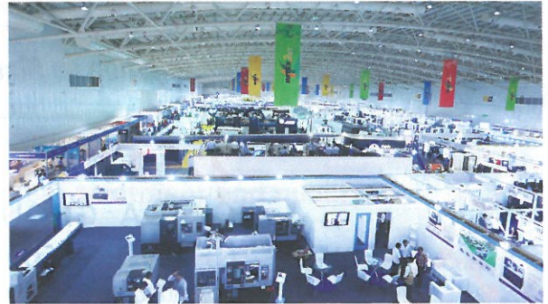
BIEC is expanding its infrastructure by constructing a new hall (Hall 5) similar to Hall 4